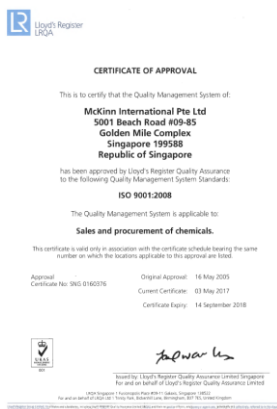
McKinn Singapore ISO Certificate