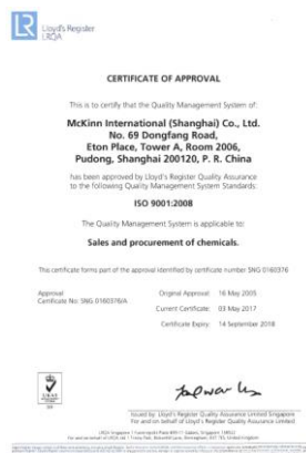
McKinn Shanghai ISO Certificate (English)