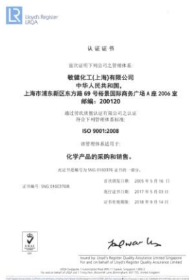
McKinn Shanghai ISO Certificate (Chinese)