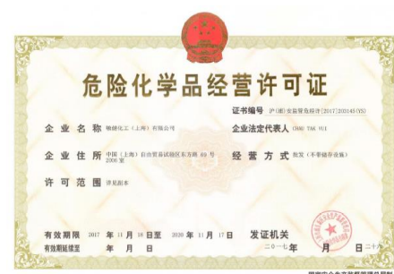
McKinn Shanghai DG Certificate