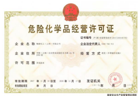
McKinn Shanghai DG Certificate