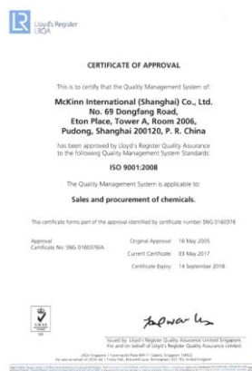
McKinn Shanghai ISO Certificate (English)