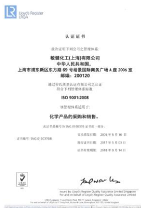
McKinn Shanghai ISO Certificate (Chinese)