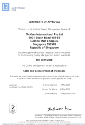
McKinn Singapore ISO Certificate